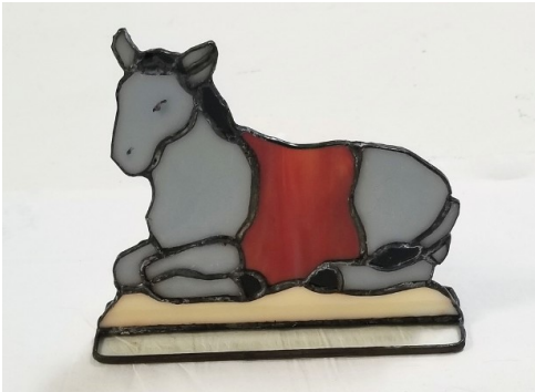
Constructed by Wanda Shorty